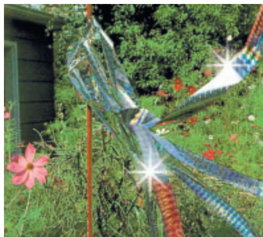
In a garden or orchard

Other applications will keep ducks and geese off of lawns and ponds where they aren't wanted, or keep predator birds away from fish farm ponds.