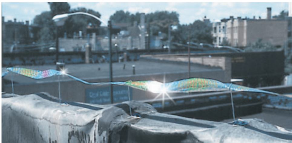
Roof ledges, sills and other linear installations

For rooflines, fences and other linear applications suspend IRRI-TAPE above roosting surfaces with the specially designed wire supports provided. (For added effectiveness attach 5' "streamers" to the main ribbon.) Other applications include: railings, copings, ledges, gutters, sills, beams and scaffolding. Also effective in eliminating "runways," those places birds land before going on to broader areas such as roofs, open fields, landfills, parking lots, etc.