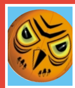
Terror-Eyes Inflatable scare device